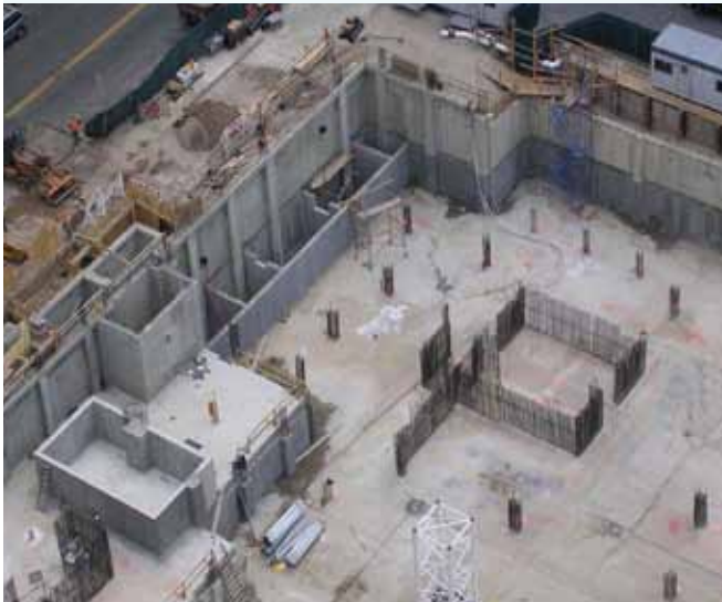
The cistern at the Solaire was integrated into the building during construction.

The cistern system is one component of a larger water reuse system in the building. A 25,000 gallon per day wastewater treatment plant is located in the building to treat sewage. Rainwater collected in the cistern is treated along with the wastewater treatment plant effluent in a UV/ozone unit prior to being sent to a combined water reuse tank. Overflow from the cistern is sent to the storm sewer. Combined reuse water is used for toilet flushing and building make-up water (water used to replace cooling system water that is lost to evaporation) in addition to providing irrigation water for two green roofs on the building. 1