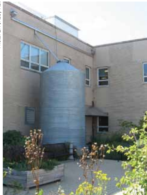
A cistern used to capture rooftop runoff in Chicago.