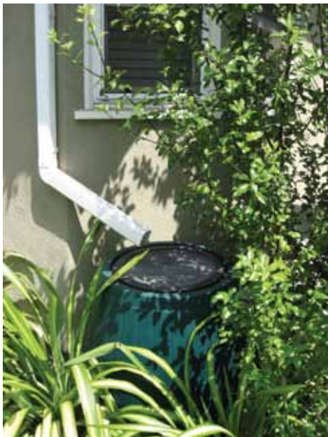
A rain barrel used to capture residential roof runoff in Santa Monica, CA.