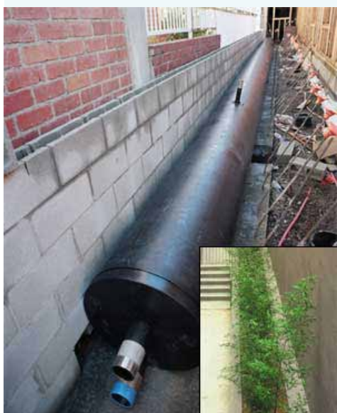
Rainwater Cistern at NRDC's Santa Monica Office (inset photo after planter planting).